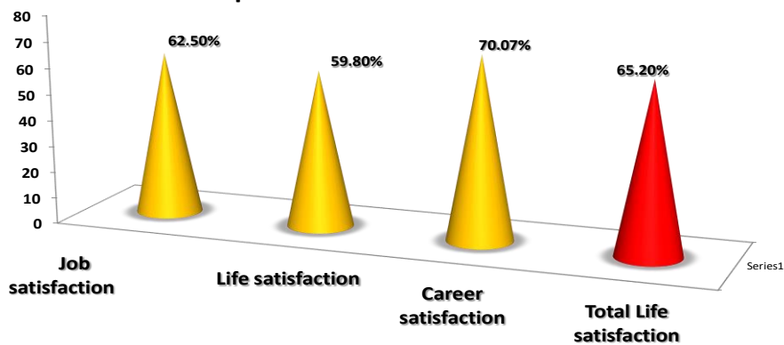
Mean percent of head nurses' Life Satisfaction